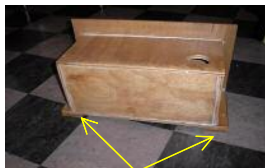
Bottom of the box, showing the battens that offset the back from the wall