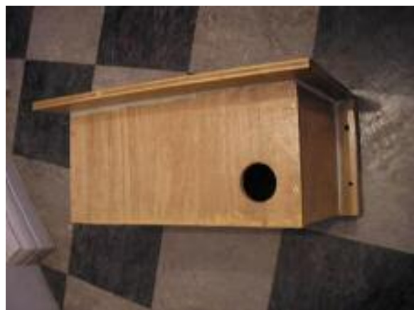
Front view showing 45mm diameter entrance hole