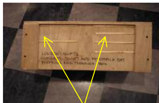
Back view showing bat roosting area

NB make sure the back of the box's roof is sealed against the wall with mastic to prevent rainwater entering the bats' roosting area.