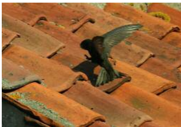
A Swift entering a roof via a displaced pantile. The nest is on the roofing felt below

Follow these rules when working on roofs where Swifts are nesting