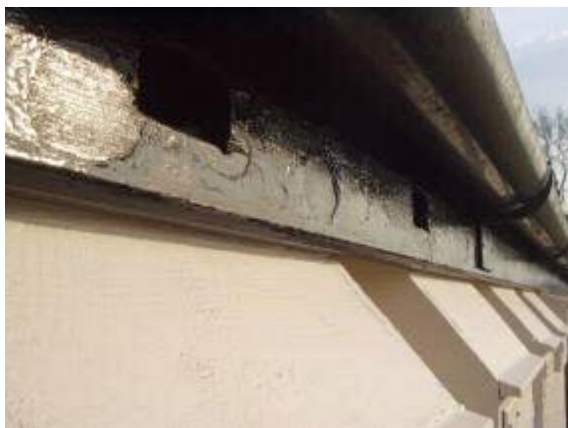
Holes cut in the facing boards let the Swifts reach their nests in the eaves of this chapel

Follow these simple guidelines to comply with the law and keep Swifts safe and breeding in your roof.