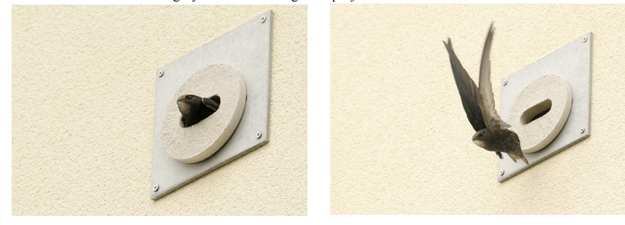
Swift exiting an internal nest box

70 pairs of Swifts breeding in 1960's buildings have been offered new accommodation in 227 nest boxes on a nearby housing estate. In 2013, Swifts used 66 out of 139 internal nest boxes, but only 9 out of 88 external nest boxes. It has been a highly successful mitigation project.