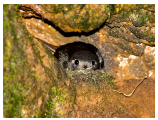
Sooty Swift Cypseloides fumigatus on the nest

The study of Swifts in a tropical country like Brazil is a challenging task. Most species are poorly known and difficult to identify in the field. Swifts from the Cypseloidinae subfamily have peculiar breeding biology characteristics which allows us to monitor populations across the country. There are more than 1900 bird species recorded in Brazil. There are 19 species of Apodidae : eight Cypseloidini (medium to large size); eight Chaeturini (small to medium size); and three Apodini (smaller species). Problems in conducting research include difficulty in field identification and basic lack of data on distribution, diet and breeding; bureaucracy and politics; logistics and costs; safety issues; lack of