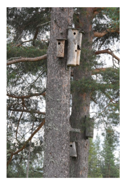
different populations of common Swifts migrate. Our current knowledge is based on a continent-wide geolocator study on the migration of common Swifts from Europe to Africa and back. We have used miniature geolocators, so-called light loggers, to track the migration and wintering of Common Swifts from several different populations in Europe from Italy in the South to Swedish Lapland in the North. There are also a number of study populations which have been tracked from the UK and central Europe. Generally the southern populations of Common Swifts breeding in Europe initiate autumn migration prior to the northern populations, and they also move to wintering areas further south to southeast in Africa south of the Congo basin. Our initial work revealed that it is predominantly in the Congo basin area where the Swedish Common Swifts winter. Central to most populations are that they pass West Africa on the migration north, make a short stopover in the region of the Liberian rainforest area, before they cross the Sahara in a fast transportation North. The project is a joint effort involving many volunteers and collaborators in several countries. I am grateful to all.

The common Swift is a spectacular migrant, which presumably spends most if not all its life on the wing. Despite being a highly admired and charismatic bird, we still lack information on which routes and to where