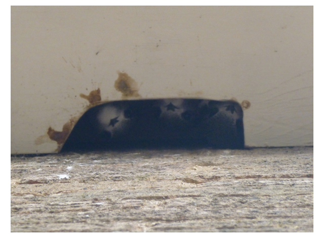
3 chicks peering out of an entrance adjacent to the wall

Swifts first bred on our house in Rutland in the East Midlands in 2004, a year after a bird was first seen to enter a box and three years after we had erected the first (double) nestbox. The colony is unusual in that it